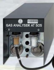
2 AT505 2003 Gas analyser module for testing petrol engine