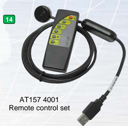
14 AT157 4001 Remote control set