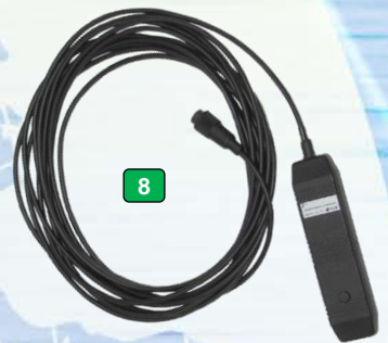
8 AT103 3031 Vibration RPM sensor RT2/3 (6m)