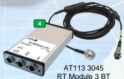
4 AT113 3045 RT Module 3 BT (RPM and Temperature sensor)