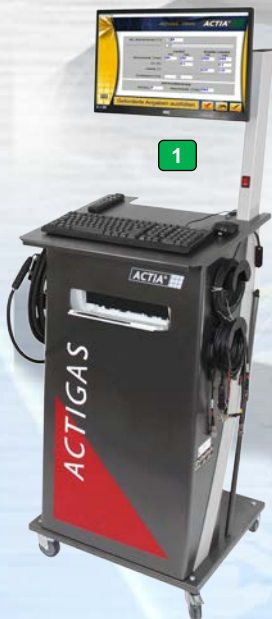
1 AT857 x100 Mobile stand