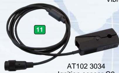
11 AT102 3034 Ignition sensor G2