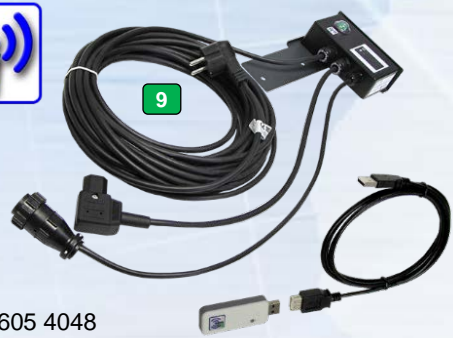
9 AT605 4048 Opac KIT / PWR – RS232 (Bluetooth)