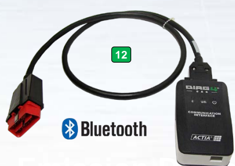
12 AT532 5082 DIAG4CAR OBT BT (Bluetooth) Read fault memory + readiness codes