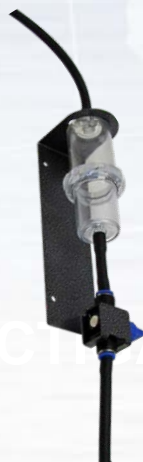
13 AT120 4014 Water separator (with valve)